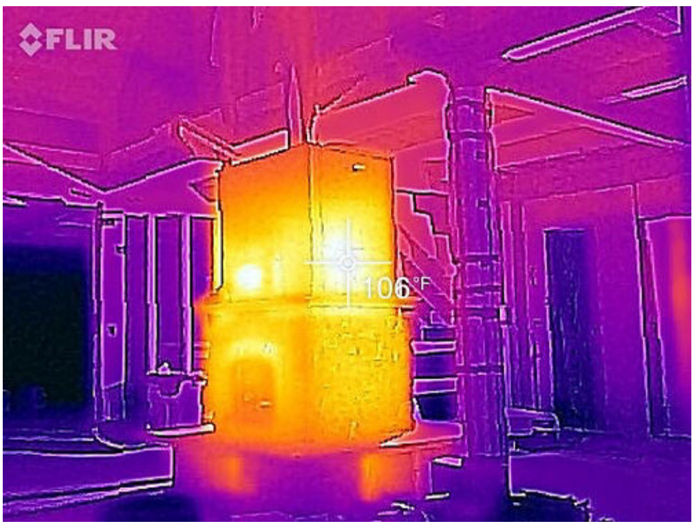
Lean on me.

The heart of a masonry heater is a firebox constructed out of a refractory material such as firebrick. As the fire burns, the gases move through the heat-exchange channels inside the heater. The warmth is absorbed by the masonry and radiates throughout the home long after the fire has gone out—often for as long as 24 hours.