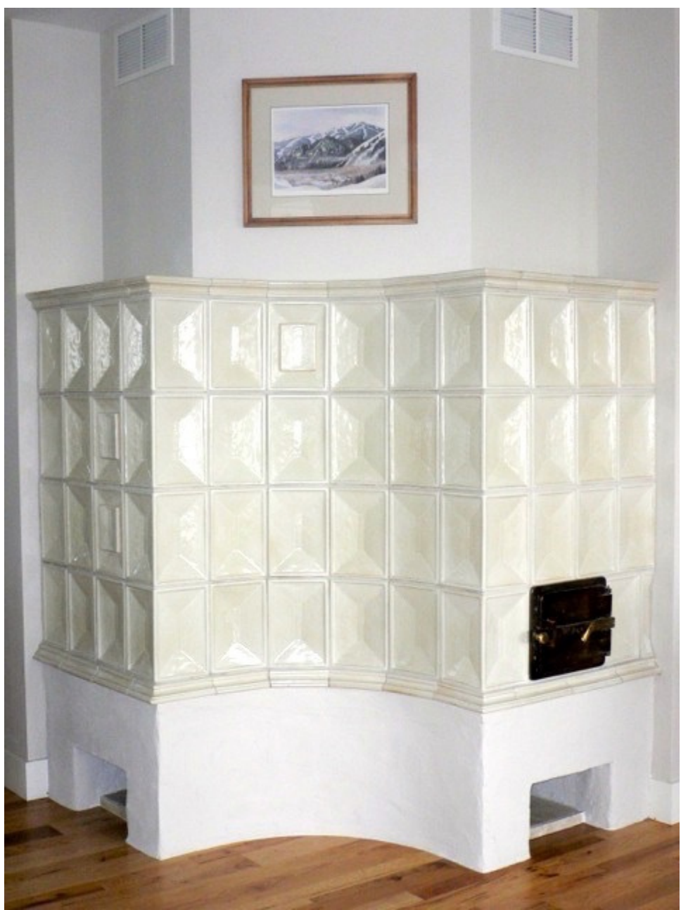
A peek into the complex workings of a Moshier-built kachelofen , or traditional Austrian/German heater, finished with kachln tile.