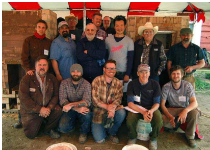
2012 HMED Students at the annual meeting

The education committee will be offering two HMED classes for the 2013 annual event. They are scheduled so that an attendee can still be involved in seminars, limited workshops, and the rest of the scheduled events at the annual meeting.