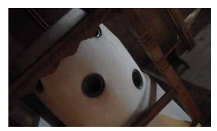
Tyrolean Folk Art Museum, Innsbruck, Austria