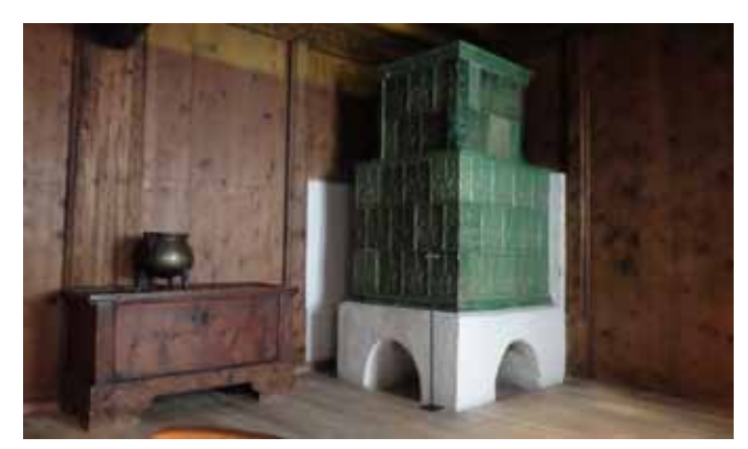
Tyrolean Folk Art Museum, Innsbruck, Austria