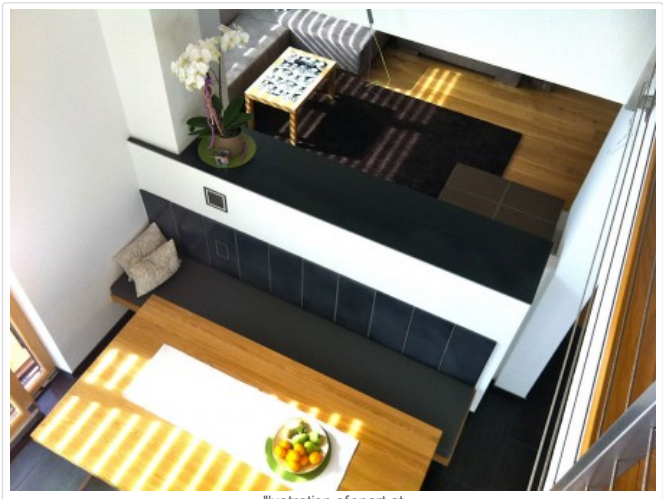
Illustration of enart.a

- The tile stove healthy, minimal air movement generating radiant heat source. Because it emits infrared rays are not directly in the air is heated, but the furnishing, interior wall surfaces, and the people staying in the same room with him, feeling the heat it provides very nice. Austria Passive houses are often built as extreme cold can compensate for the ventilation system built on air-to-air heat pump efficiency is decreasing, and the outside cold to incoming residents can hide in a frozen solid surface to warm. In the case of passive houses typical air heating in the apartment would not be so melegedőhely.