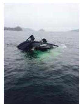
Eyak 2015.JPG 333K