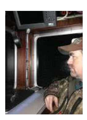
Driving Eyak.jpg 296K