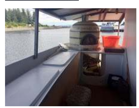
Rear Deck.jpg 307K