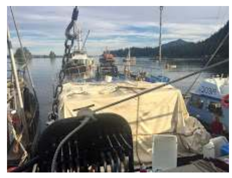
Fishing Boats.jpg 347K