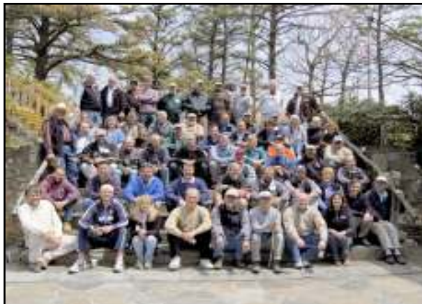
MHA members at Wildacres 2006