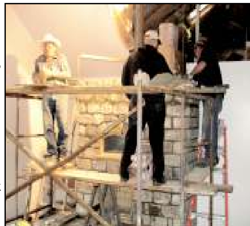
Team effort as construction progresses

Deadwood is a very interesting town, and I can recommend it as a vacation destination. There are interesting museums in town, the visitor's center to visit, and plays depicting the old Deadwood during the summer months. You can even stay at the historic Bullock hotel, which is reportedly haunted by Sheriff Bullock himself. Also visit Wild Bill Hickock and Calamity Jane's graves and the site where Wild Bill was shot in 1876 at the original site of Saloon #10.